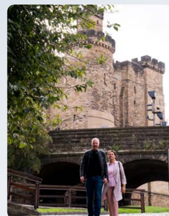
■ Newcastle Castle