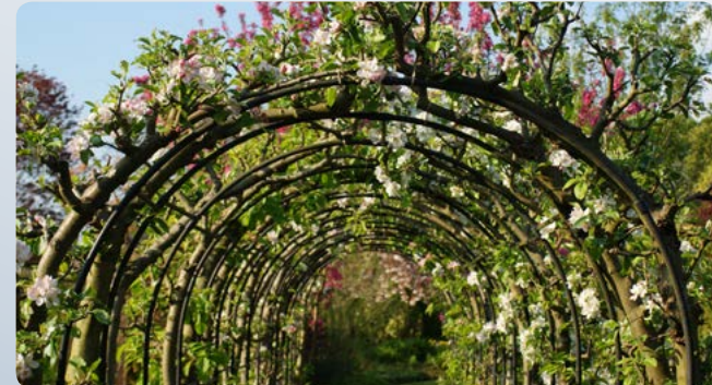
■ Barnsdale Gardens