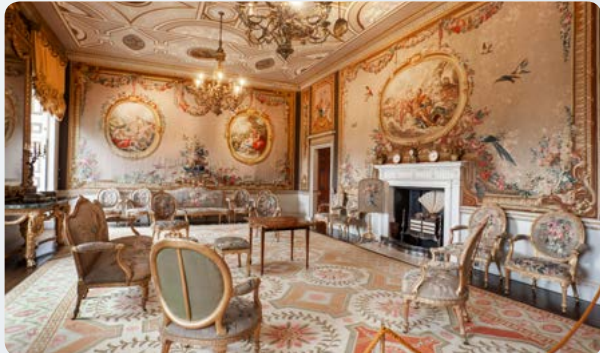
■ Newby Hall

Every era of English history builds new monuments to wealth, architecture and status, be it castles that once defended the realm, or the stately homes that have come to define it. Travelling the Explorer's Road paints for visitors a vivid and awe-inspiring picture of English history, society and time with an intriguing secret hidden behind every door.