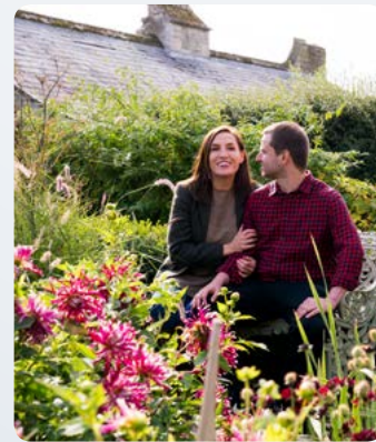
■ Easton Walled Gardens

The English love to garden and to share their green-fingered creativity and passion. From the intriguing stories of eccentric owners to the impressive landscapes of grand estates cultivated by world famous horticulturalists, Rose to Radish is packed with botanical secrets to uncover and beautiful scenes to explore.