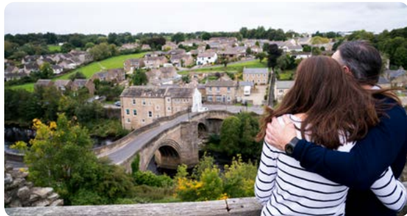
■ Barnard Castle

For two thousand years the English have travelled a highway which connects north to south along a 300-mile route through the historic and cultural heart of the nation.