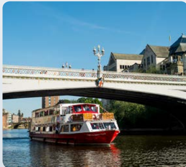
■ City Cruises York

On two feet or two wheels, in classic cars, along rivers and into the estates of the landed gentry, there are many ways to explore England and see it from a different perspective. Take to the water in a kayak, circumnavigate a lake by bike or walk a heritage trail in the company of a local guide. The Explorer's Road will take you off the beaten track to reveal sites and stories that aren't on the usual tourist trail.