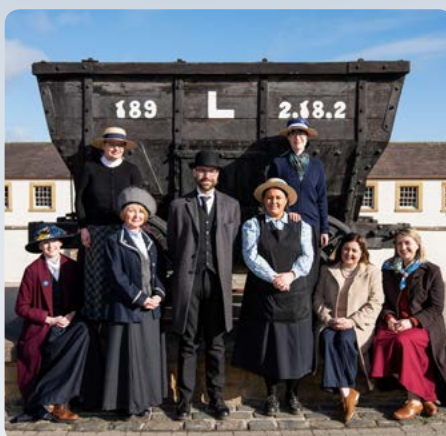
■ Beamish, The Living Museum of the North

The English take afternoon tea and amass vast collections of everything from clocks to horseshoes. They made Robin Hood and Dick Turpin folk heroes. And they invented Earl Grey tea. Often shaped by these eccentric ancestors, The Explorer's Road is a chance to uncover the quirks and peculiarities which have sculpted England's cultural landscape.