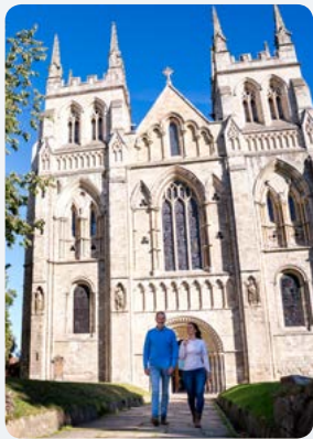
■ Selby Abbey